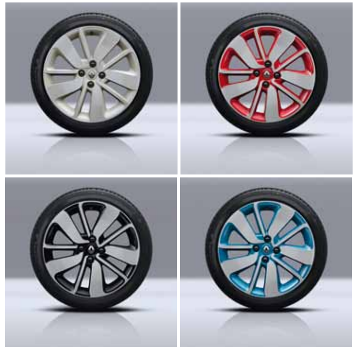
17-inch 'Drenalic' wheels (available from November 2012)