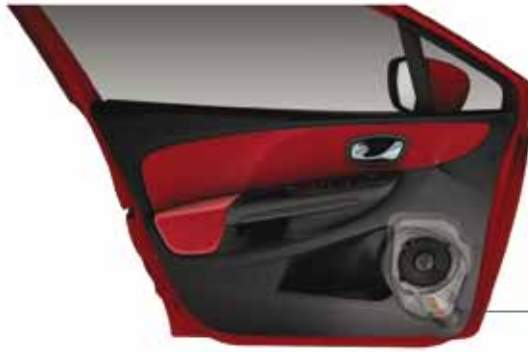
INTEGRATION of a vented loudspeaker in the door of Clio IV